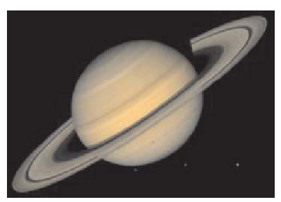
Saturn tips her jaunty hat.