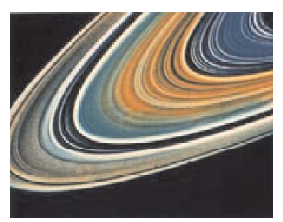
The small color differences in Saturn's rings have been enhanced in this picture from Voyager 2 data.