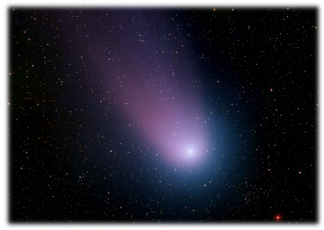
This image of Comet C/2001 Q4 (NEAT) was taken at Kitt Peak National Observatory near Tucson, Ariz. in 2004.

Comet tails have been discovered to be so long that Voyager 2 passed through one that was thousands of miles away!