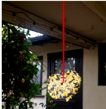
A finished birdseed wreath.

Birds will love this simple bird feeder!